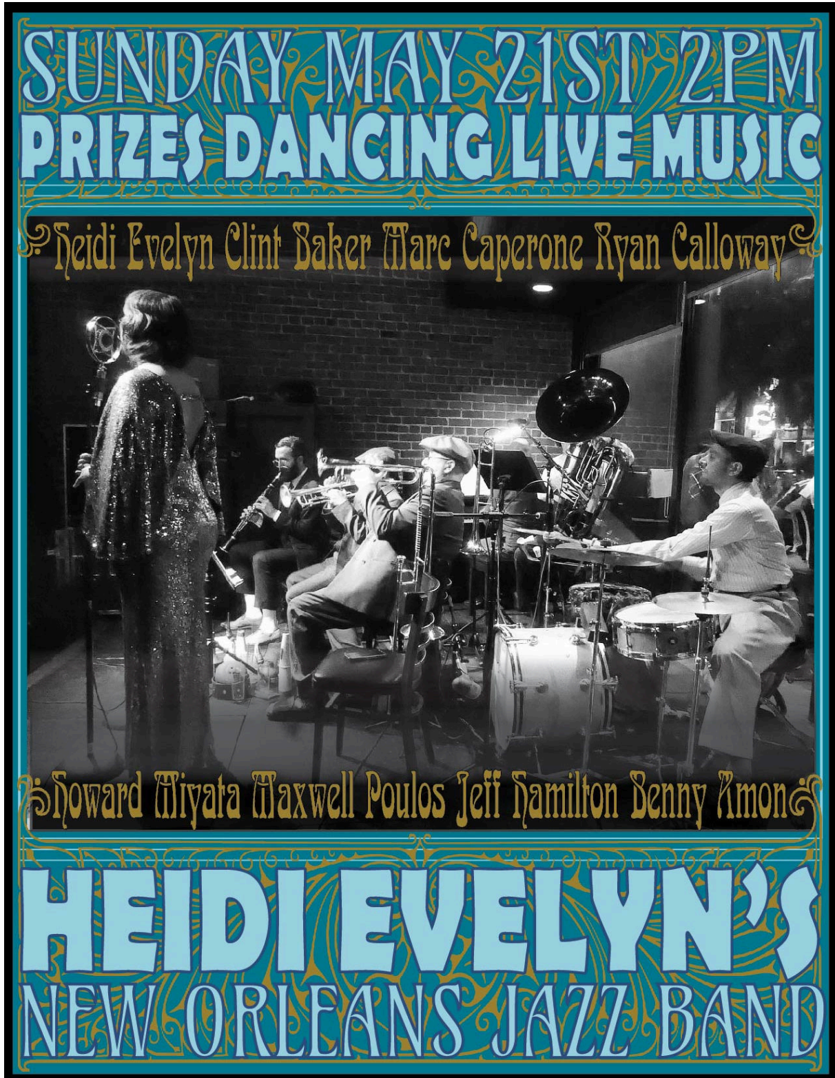
Cover Artwork: Heidi Evelyn Arnot • Layout & Typesetting: JoAnn Schwartz, Coastal Graphics

PLUS -- Ragged Rascals Youth Jazz Band & South Bay Jammers, 1 PM