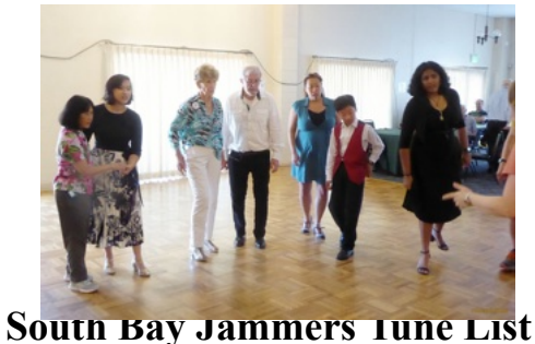
Upcoming: August 27th, 2023